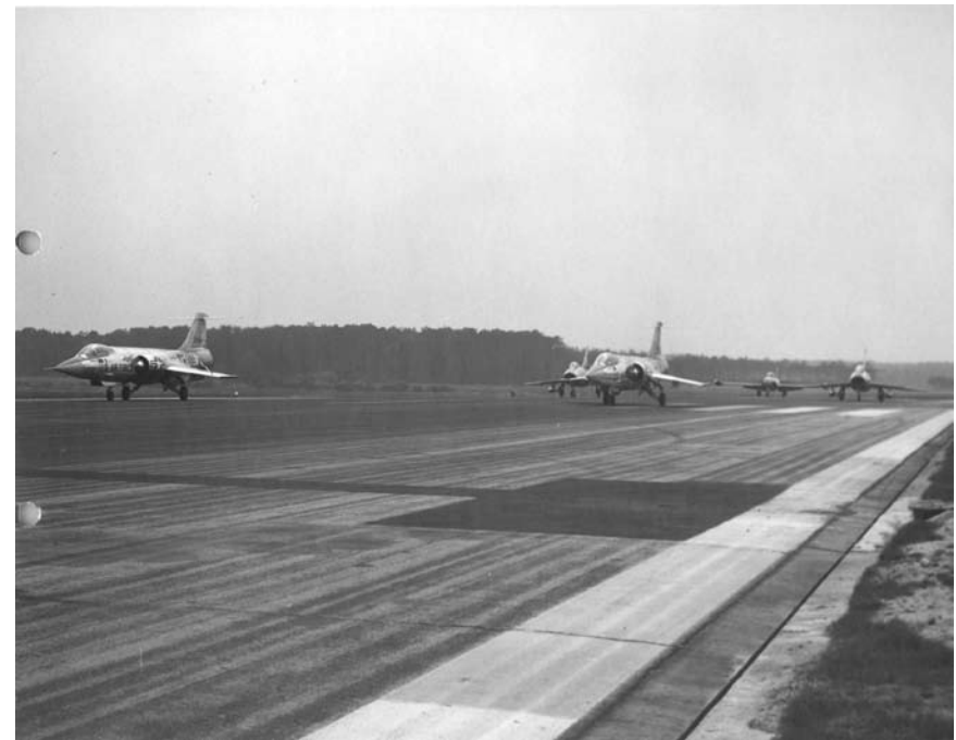
F-104 Starfighter from the 151st landing at Ramstein, accompanied by a French Mystere IV.

capability . . . organized, trained, and inspected exactly like our active duty units. Our ANG units . . . [are] capable of instant action.” 43 As for the capabilities of the 134th Fighter Group, given time to maintain its jets and train adequately, it was a very good combat unit that was ready to fly, fight, and if necessary deploy overseas. It did not have the ability, however, to quickly sustain flight operations from an overseas base once it got there. After a number of weeks, once it settled into a routine at Ramstein, it out-performed its peers. It did the same, given time, after it returned to Alcoa. It met the standards for combat readiness that Air Defense Command set about a month after coming back to the United States.