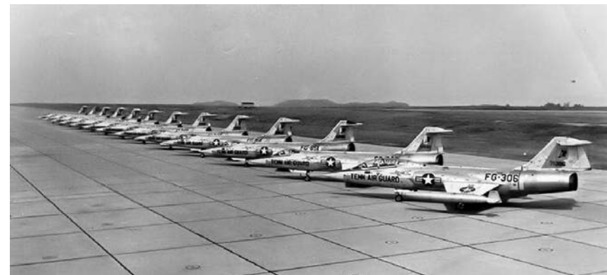
F-104 Starfighters from the 151st Air National Guard, their “TENN AIR GUARD” markings still in place.

Lockheed was proposing equipping the F-104 with the capability of dropping a nuclear bomb, just in case the Air Force needed it to do so in an “emergency,” citing its exceptional speed as an asset for this bombing mission. Although originally intended as a weapon against rival Soviet fighters, the Starfighter first entered service with the Air Defense Command in 1958, which wanted 157 of the jets for continental defense against Soviet bombers. These would serve as interim interceptors between the F-102 and F-106. Its speed and climbing capability would ensure that no Soviet bomber could escape from it, but the Air Force soon realized that it had tasked the ‘104 with a mission it was ill-suited to perform. Starfighters lacked the internal space for the avionics necessary for an air defense interceptor, and it could not carry the radar or fire control black boxes required for radar-guided missiles for finding and shooting down aircraft at night. There was no way it could destroy a bomber which escaped into cloud cover. Lockheed even tried to persuade the Air Force to purchase an improved all-weather version which would utilize as its main weapon an MB-1 “Genie” air-to-air rocket with a nuclear warhead, but the Air Force opted to stick with the F-106 as its penultimate interceptor. Thus the Air Force transferred its F-104s to the Air National Guard after just two years of active duty service. 25