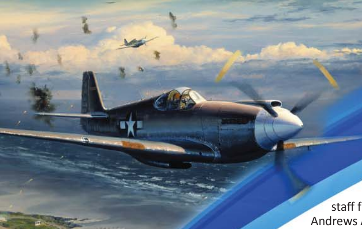
Mission Over Normandy

air national guard readiness center (continued)